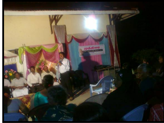
A grand birth day function was celebrated , during the function DPD explain the concept of Adopt a Elderly "Village"