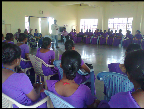
School of Nursing students visited TEV for Geriatric care and to know Palliative care practice.