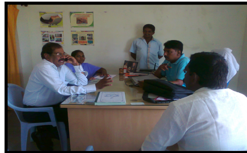
To strengthen the security service – DPD discussing with team leader of the Subicsa Security service and to introduce care system for visitors.